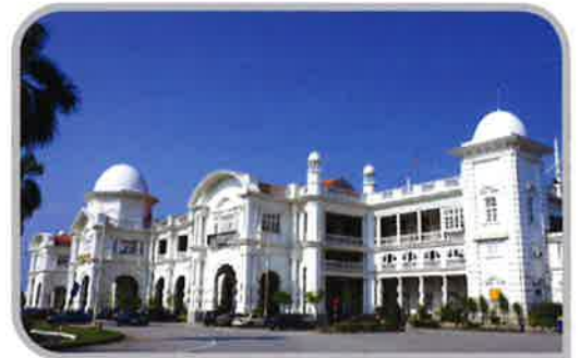
Ipoh Railway Station

The cost of living is cheaper in Ipoh in terms food, housing, transportation and recreation. The peaceful nature of Ipoh City also makes it the perfect place for an educational experience.